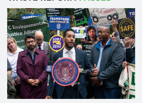
A law to mandate commercial waste zones, created by a TA-backed coalition, will protect pedestrians by controlling how waste trucks use city streets.