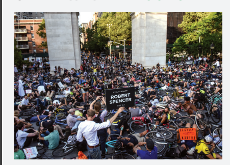
A strategy to protect bicyclists, announced after a massive TAled protest, will accelerate bike lane installation and create the city's first bike boulevard.