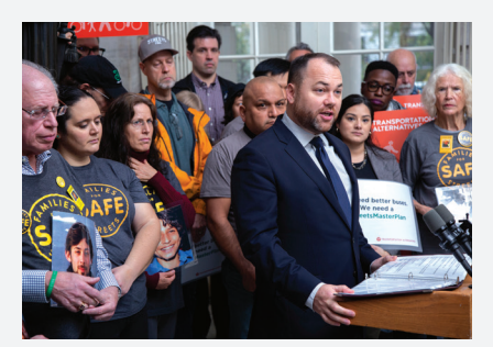
A monumental streets-forpeople plan, supported by TA, will create hundreds more miles of protected bike and bus lanes and acres of walking space.