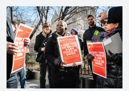
A street design checklist, inspired by Vision Zero and developed by TA, will mandate how safety for cyclists and pedestrians is added to city streets.