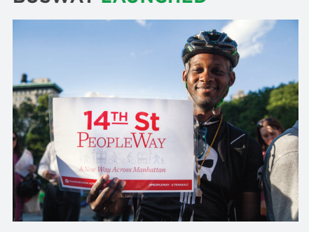
A car-free busway, conceived by TA, will shorten bus commutes, make cycling safer, and create more public space.